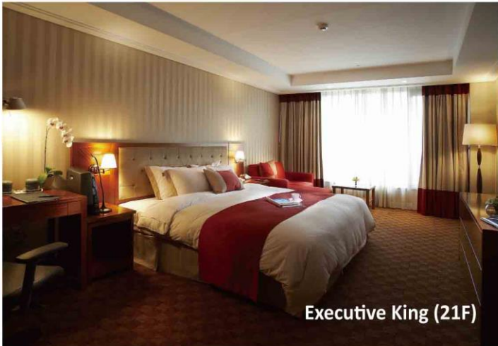
Executive King (21F)