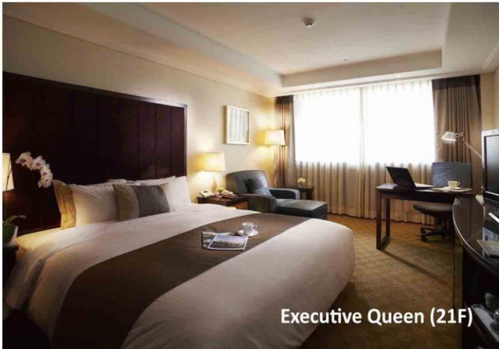
Executive Queen (21F)