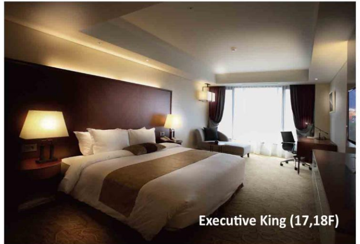
Executive King (17,18F)