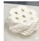
Fig. 1. A 3D printed zeolite filter

Through 3D printing, zeolite 13X inks were printed well with 0.6 mm of a nozzle through air pressure as shown in Fig 1.